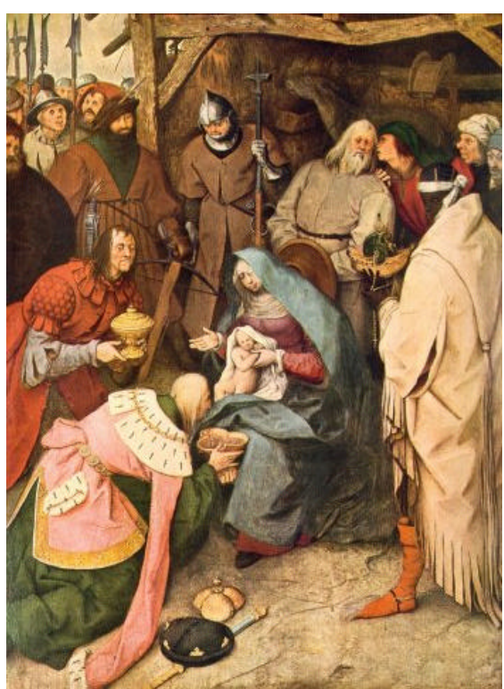
Adoration of the Magi - Bruegel