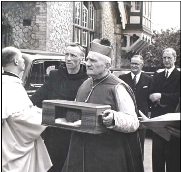
Translation of the Skull of St. Simon Stock.

At the same time, the solemnity attached to translations was by no means a peculiarity of the Celts. The story of the translation of St. Cuthbert's remains is almost as marvelous as any in Celtic hagiography. The forms observed of all-night vigils, and the carrying of the precious remains in "feretories" of gold or silver, overshadowed with silken canopies and surrounded with lights and incense, extended to every part of Christendom during the Middle Ages. Indeed this kind of solemn translation ( elevatio corporis ) was treated as the outward recognition of heroic sanctity, the equivalent of canonization, in the period before the Holy See reserved to itself the passing of a final judgment upon the merits of deceased servants of God, and on the other hand in the earlier forms of canonization Bulls it was customary to add a clause directing that the remains of those whose sanctity was thus proclaimed by the head of the Church should be "elevated", or translated, to some shrine above ground where fitting honor could be paid them.